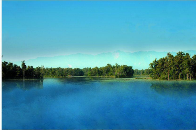
घोडाघोडी ताल कैलाली