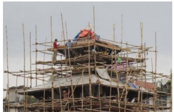
Workers renovating the roof of a temple at Basantapur in Kathmandu on Wednesday.