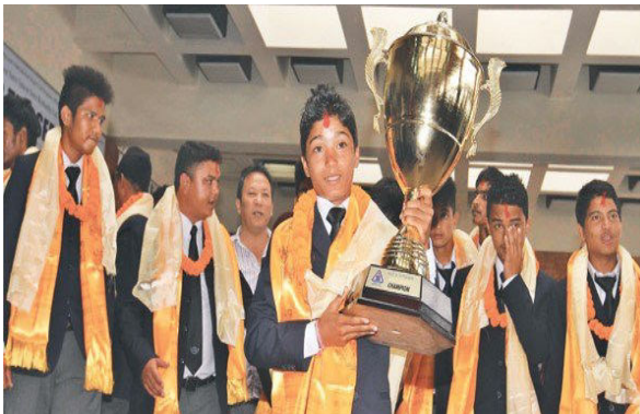
The ACC U-16 Premier League champion Nepali cricket team upon their arrival at the Tribhuvan International Airport in Kathmandu on Thursday.