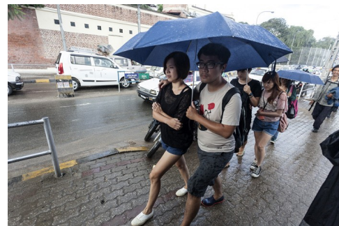
Tourists scramble under umbrellas in Tri Devi Marga, Thamel, as a momentary burst of drizzle hit Kathmandu on Thursday.