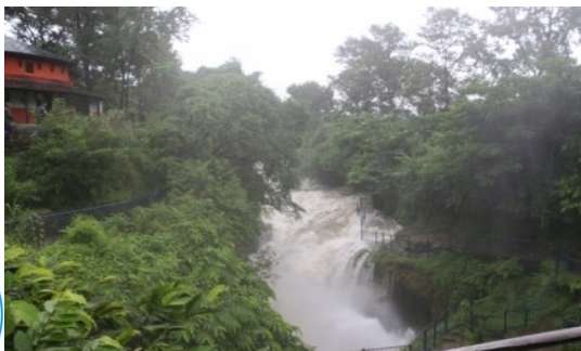
A POPULAR TOURIST ATTRACTION- DEVIS FALL IN POKHARA