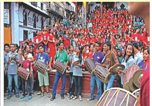
People watching the chariot of Living Goddess Kumari in Basantapur (left) and local youths playing traditional musical instruments to celebrate the chariot-pulling ceremony near Kumari Ghar, on the second day of Indra Jatra festival, in Kathmandu, on Tuesday.