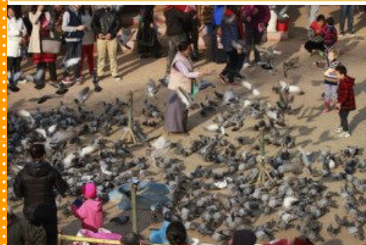
A woman feeding pigeons as children enjoy playing with the birds near Boudhanath Stupa, Kathmandu, on Wednesday. Boudhanath, a UNESCO World Heritage Site, is popular for Buddhist holy rituals and a major tourist destination.