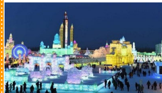
China (Harbin) International Ice and Snow Festival