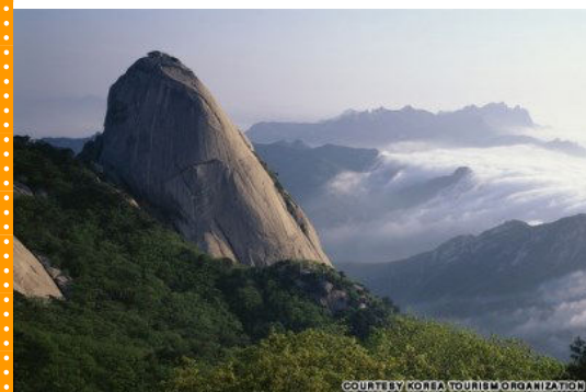
Bukhansan Peak in South Korea