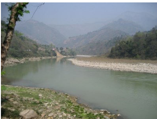
Trishuli River : A major rafting river of Nepal

The figures released by the Immigration Office, Tribhuvan International Airport, reveal that visitor arrivals in the year 2014 by air decreased by 0.3 %, compared to the year 2013. A total of 585,981 international visitors were recorded to have arrived in Nepal in the year 2014 which is less by 1,861 as compared to the year 2013. In the year 2013, a total of 587,842 tourists were recorded to have entered Nepal by air.