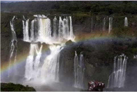
A rainbow forms over tourists visiting Iguazu Falls in Foz do Iguazu, Brazil, on March 15.