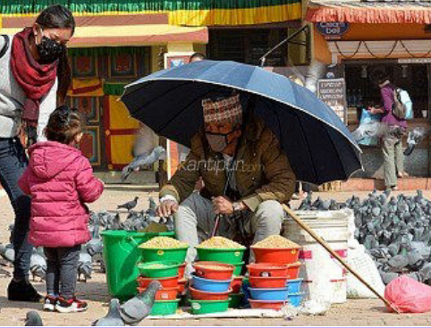
A man sells grains on the premises of Bouddha Stupa in Kathmandu.