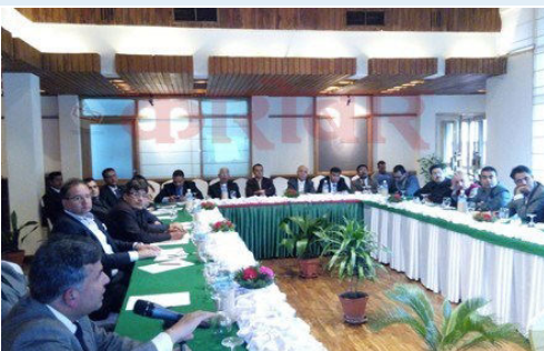
Tourism entrepreneurs during a conference organized by Hotel Association of Nepal on potential of tourism in Nepal.