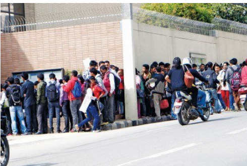
Youths queue up in front of the Japanese Embassy in Kathmandu for student visa. Japan has been attracting a lot of Nepali students in recent times.