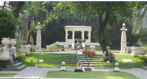
Garden of Dreams at KaiserMahal, Kathmandu