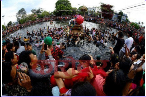
Devotees sink the chariot of Tudhadevi in Gahanapokhari, celebrating the festival of searching jewelries at Handigaun, KTM.