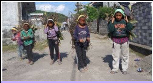
Kids fetching firewood from the Raniban jungle near Chhorepatan of Pokhara.