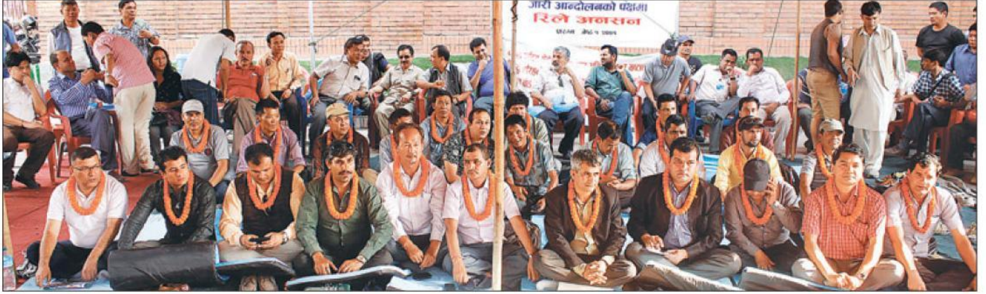
■ Tourism entrepreneurs on a relay hunger strike at the Nepal Tourism Board premises on Thursday. Thirty-five associations working in the tourism sector are demanding the government to investigate irregularities in the board.