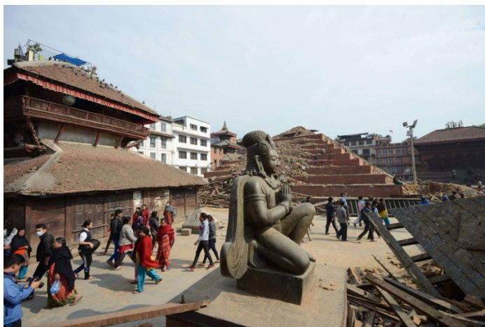
People walk by the earthquake damaged Durbar Square in Kathmandu