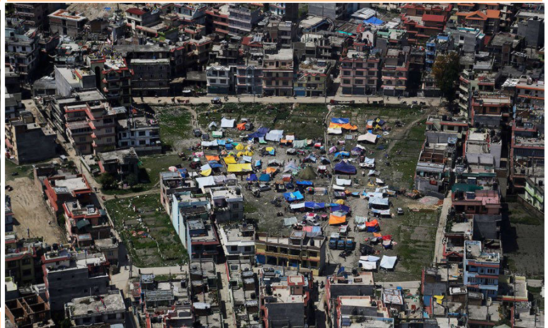
An aerial view of tents setup by residents in Kathmandu