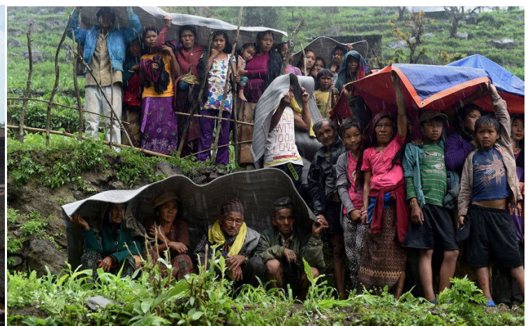
Nepalese villagers shelter from rain following the Earthquake