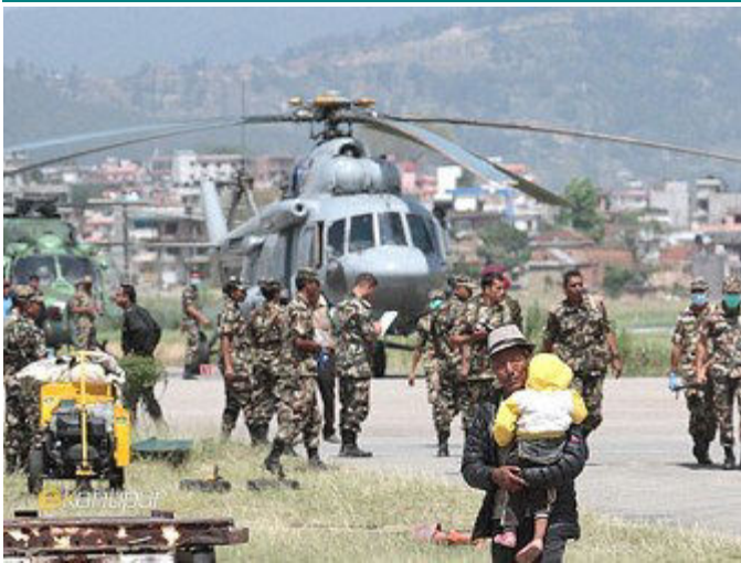
Nepal Army personnel ferry the injured people rescued from the quick-ravaged area of from Sindhupalchok at TIA in Kathmandu on Thursday.