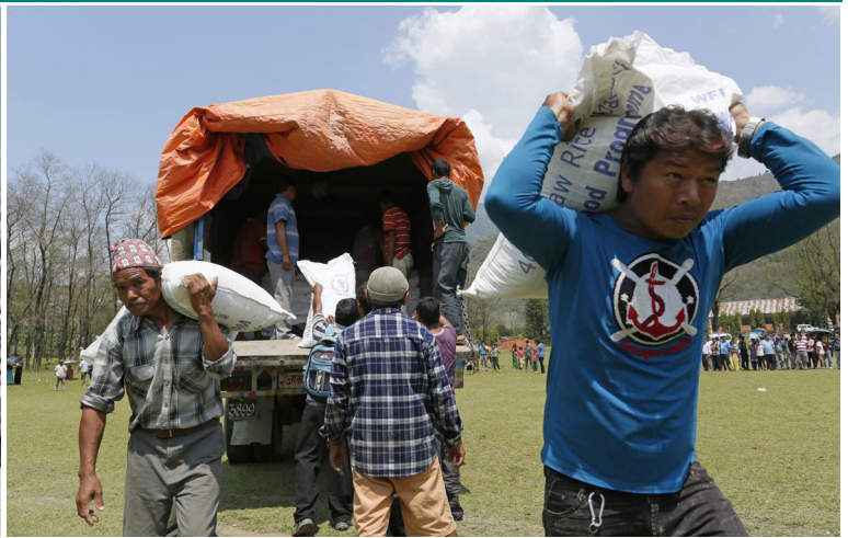
Volunteers carry bags of food supply from a cargo truck to an aid helicopter in Majuwa village, in the Gorkha District of Nepal.