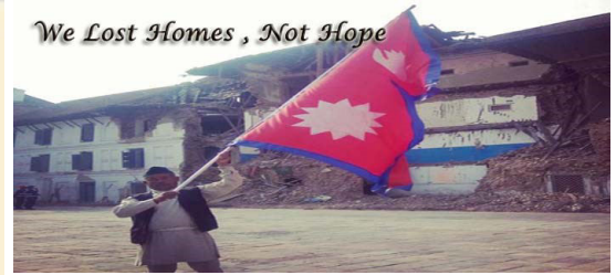
We Lost Homes , Not Hope

In popular destinations like Pokhara, Chitwan, Lumbini, Banskali, Bharu, Annapurna Region, Everest Region etc. are safe and in full operation.