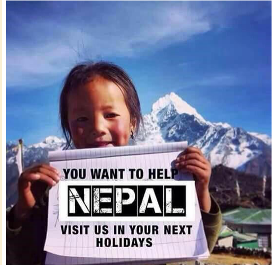
...and the sun will RISE AGAIN