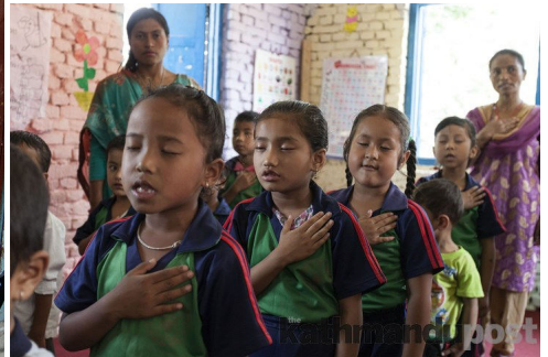
Happy faces of students in school as it reopened after more than a month.