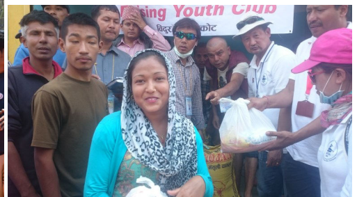
Happy faces of victims of Earthquake as they receive relief materials.