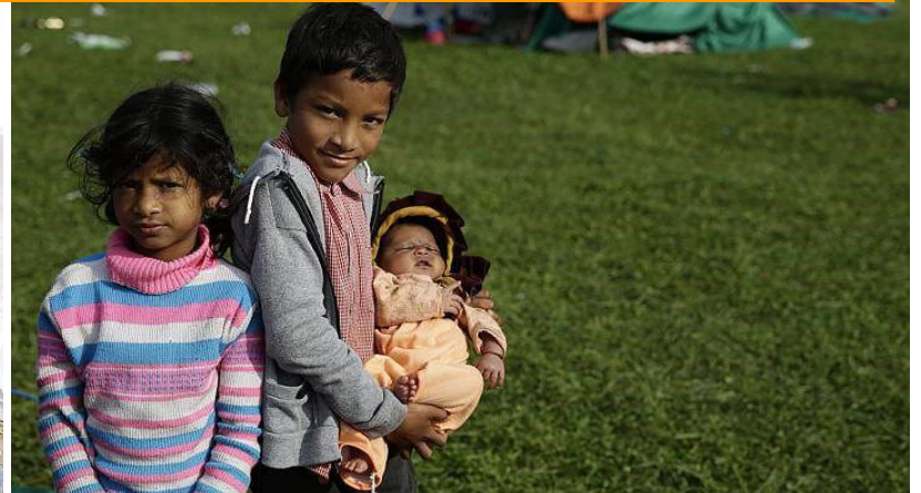
Happy faces of Children at their camp.