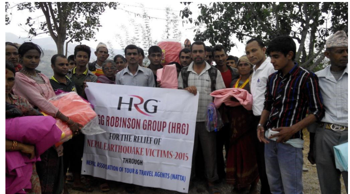
In distribution of tarpaulins to the victims at Okhaldhunga