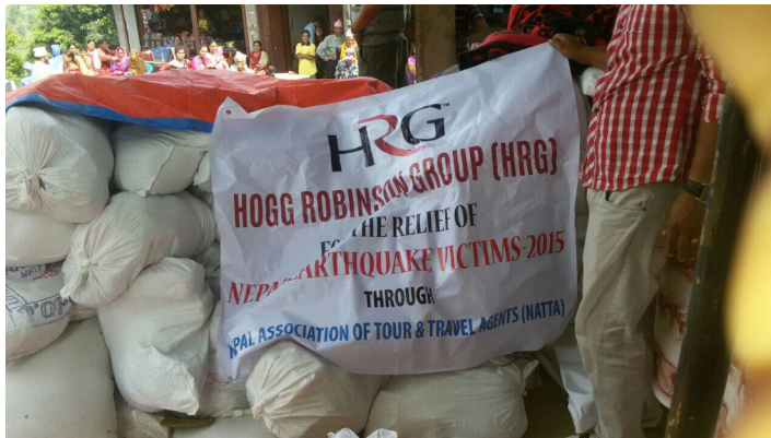
In distribution of sacks of rice to the victims at Parbat