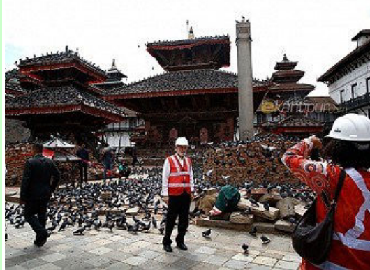
A foreign delegate poses for a shot during his visit at the Basantapur Durbar Square in the Capital.