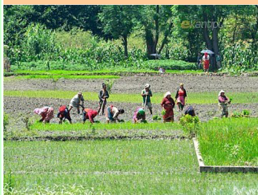
Locals plant paddy on their fields at Madhyapur Thimi in Bhaktapur. Farmers are busy planting paddy on their fields in the valley with the onset of monsoon.