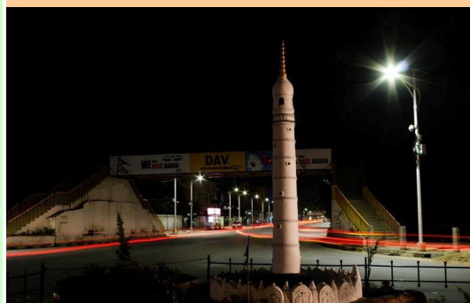
Replica of Dharahara in the night view at Sundhara, Kathmandu.