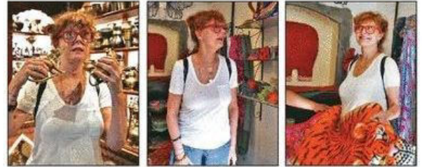
An Academy Award winning actor, Susan Sarandon , has starred in films like 'Stepmom', 'Atlantic City', 'The Calling' among many other noted works. She has also worked as the Goodwill Ambassador of UNICEF in 1999 and Food and Agriculture Organisation (UN) in 2010.