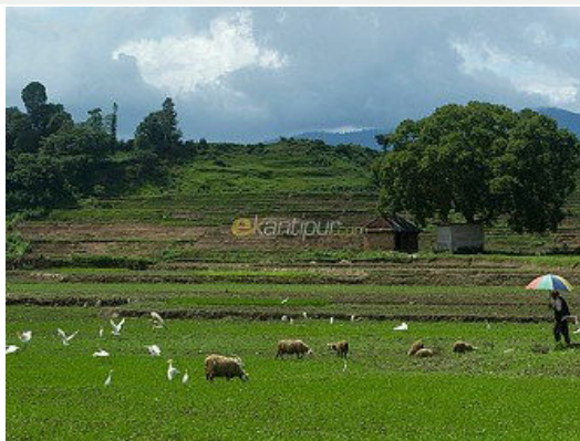
A farmer grazes his cattle at a green pasture in Khokana, Lalitpur.