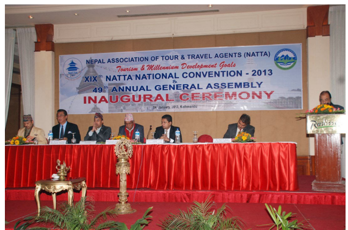
Distinguished Guests present in 19th Convention 2013