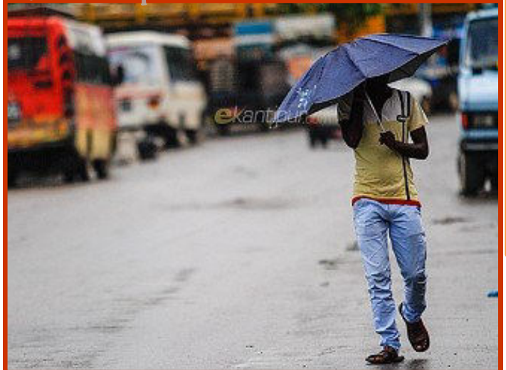
A man holds an umbrella during a drizzle in the capital.