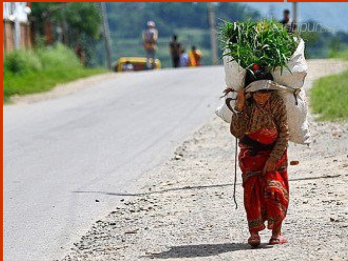
An elderly woman carries fodder for the cattle at Chyasikot, Lalitpur.