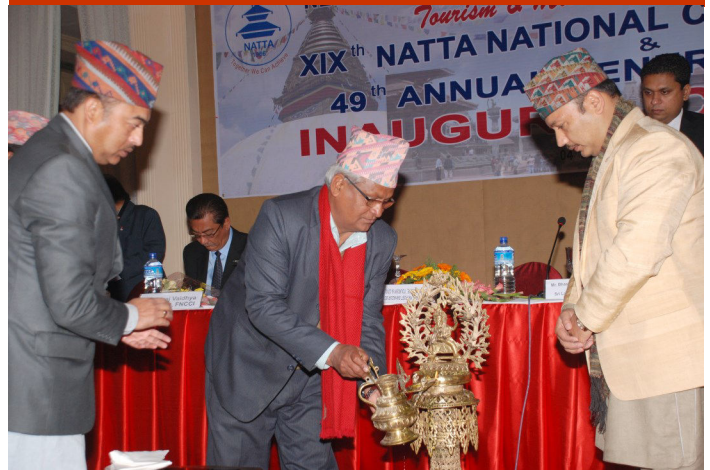
Hon'ble Tourism Minister inaugurating the ceremony 19th Convention 2013