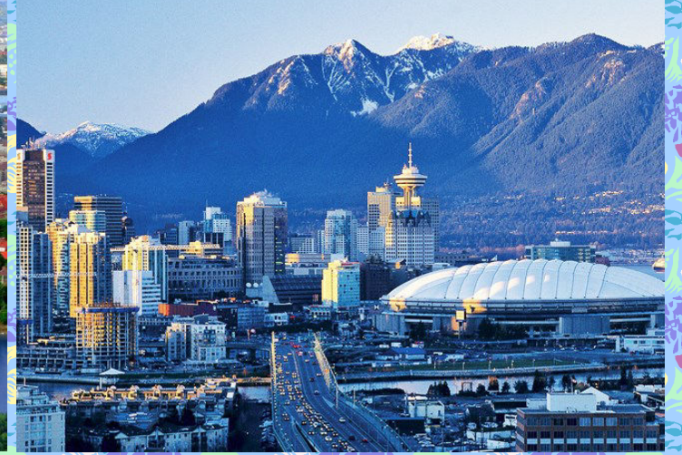
३. भ्यान्कोभर, क्यानाडा