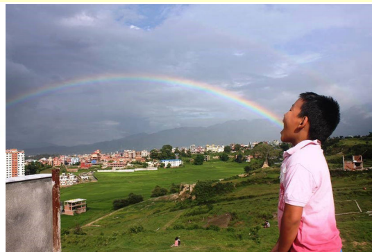
Kid pose in the rainbow celebrating World Photography day on 19th August.

Contact @ NATTA Secretariat +977-1-4418661, 4419409