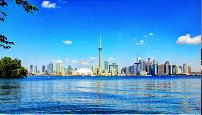
४. टोरन्टो, क्यानाडा