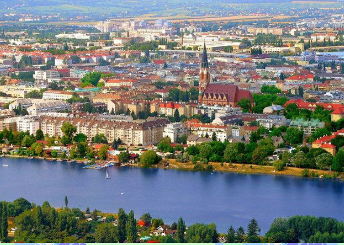
२. भियना, अष्ट्रिया