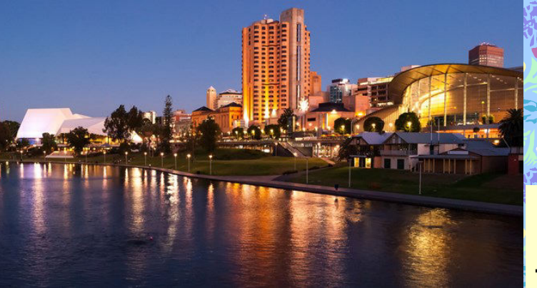
५. एडिलेड, अष्ट्रेलिया

बस्न अयोग्य शहर: .१. त्रिपोली, लिबिया पपुवा न्यूगिनी .४. ढाका, बंगलादेश