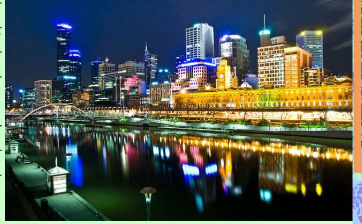
१. मेलबर्न, अष्ट्रेलिया

इकोनोमिस्ट इन्टलिजेन्स युनिट (इआइयू) ले विश्वका १४० शहरहरूको सर्भेक्षणपछि मेलबर्नलाई एक नम्बरमा राखेको हो । सर्भेक्षणमा स्वास्थ्य सेवा, शिक्षा, स्थायित्व, संस्कृति र वातावरण तथा पूर्वाधारका आधारमा शहरहरूलाई श्रेणी विभाजन गरिएको थियो । अष्ट्रियाको भियना, क्यानाडाको भ्यान्कोभर, क्यानाडाकै टोरन्टो र अष्ट्रेलियाको एडिलेड क्रमशः दोस्रो, तेस्रो, चौथो र पाचौं नम्बरमा छन् । पाँच वर्षको अवधिमा सिरियाको राजधानी दमास्कसको बस्नयोग्य वातावरण सबैभन्दा तीव्ररूपमा खस्केको देखिएको छ । सबैभन्दा सुधारिएको शहरका रूपमा जिम्वावेको राजधानी हरारेलाई लिइएको छ । सर्वेक्षणमा सबैभन्दा बस्न अयोग्य शहरको सूचीमा भने लिबियाको त्रिपोलीलाई एक नम्बरमा राखेको छ ।