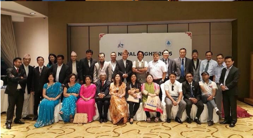
An event 'Nepal Night' with dignitaries and participants of MATTA Fair in Malaysia, Kuala Lumpur