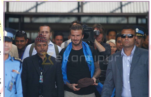
English footballer David Beckham arrived in Kathmandu on Friday morning. He is here to play football as a part of a funding campaign for UNICEF.