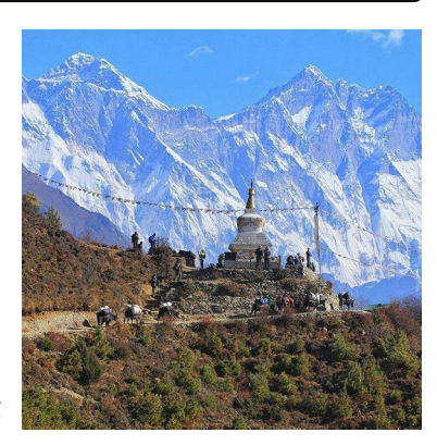
Greetings from Solukhumbu!!

Minister Poudel and handed over a memorandum stating that the Ministry should take necessary steps to organize Himalayan International Travel Mart in partnership with NATTA in Kathmandu and gather the support of the Government of Nepal to make it a great success. NATTA has also urged the Minister to start initiation from now by mobilizing all concerned.