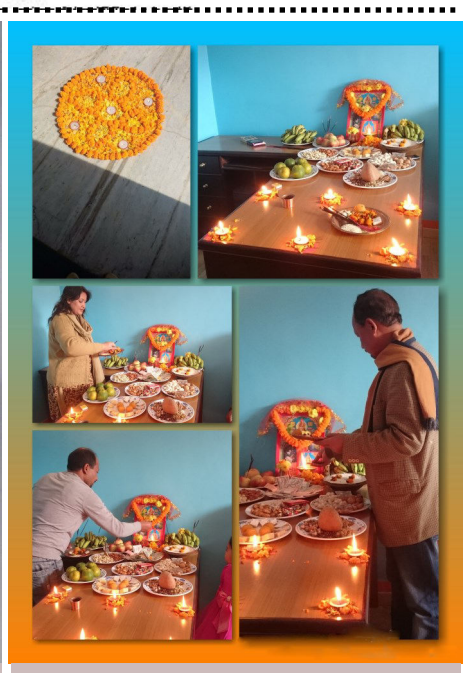
NATTA President and Executives offering Laxmi Puja at Secretariat.