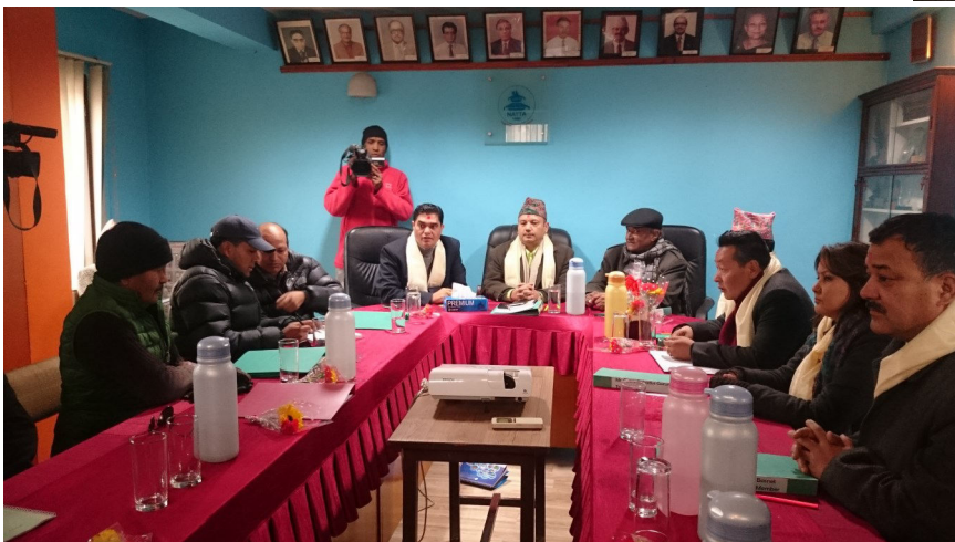
JAT accorded honor to the new Committee at NATTA Secretariat