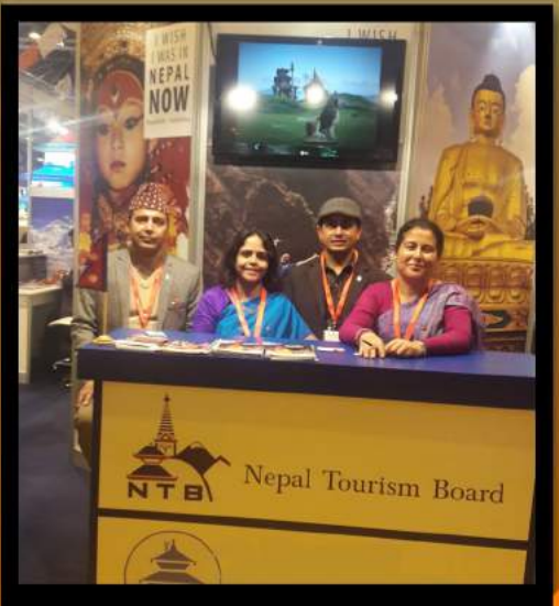
Glimpses of FITUR 2016 held on January 20th –24th at Madrid, Spain