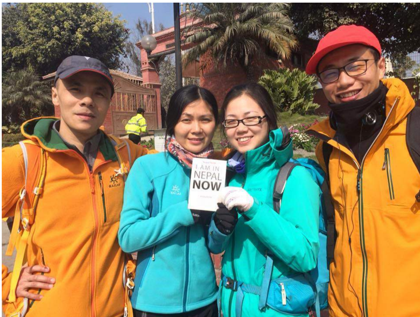
After the government of Nepal has decided to waive off the visa fee for Chinese nationals, the flow of Chinese tourists in Nepal has increased rapidly. The free visa policy of Nepali government brought this group back to Nepal for second visit within a short period.