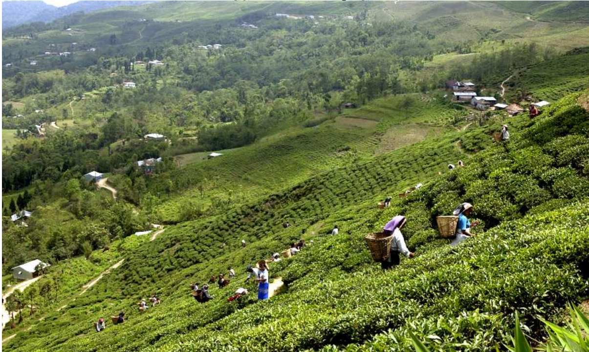
Tea Picking at Kanyam, Illam, Eastern Region of Nepal