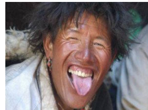
a Tibetan showing respect

Nepal Association of Tour and Travel Agents (NATTA) (Official Page)