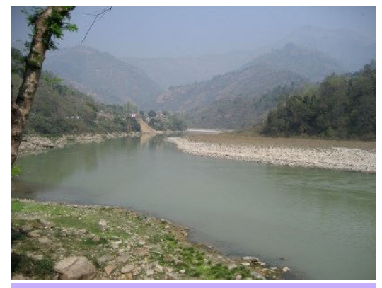
Trishuli River: A major rafting river of Nepal