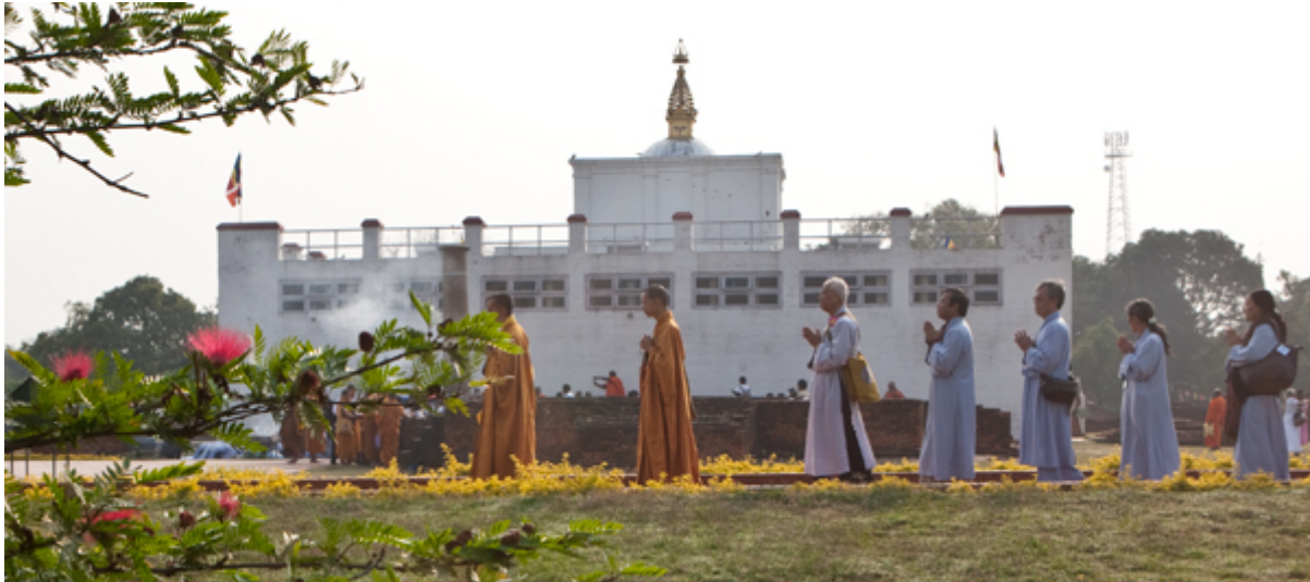
Mayadevi Temple, Lumbini

Nepal is a wonder land, truly gifted by nature.