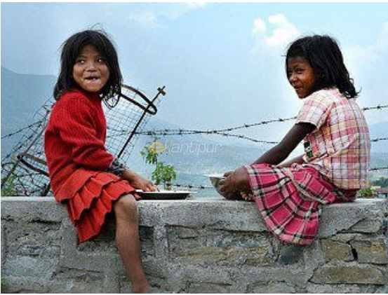
Children take their meals sitting on a wall at Sainbu, Lalitpur. The children displaced by recent earthquakes have been living in temporary tents.