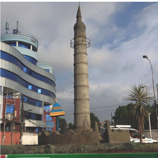
Replica of Dharahara in Sundhara.