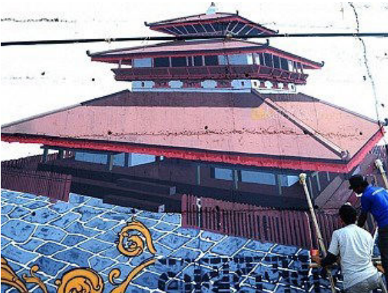
Artists paint a picture of Kasthamandap temple on the roadside wall at Babarmahal, Kathmandu. The temple was destroyed by the recent earthquake.