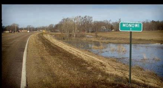
"Monowi" is a town in Nebraska that has a population of just one person; the Mayor pays taxes to himself.