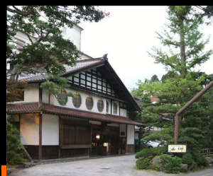
In Japan there is a family that has run the same hotel for nearly 1,300 years... or 46 generations