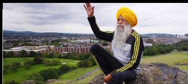
Fauja Singh started running when he was 89 to cure his depression after his son was killed in front of him. Just before turning 102, he ran the Hong Kong 10k in 1:32:28 as the world's oldest marathon runner.