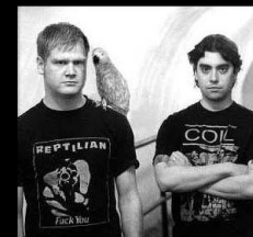
Hatebeak is a death metal band whose lead singer is a parrot.