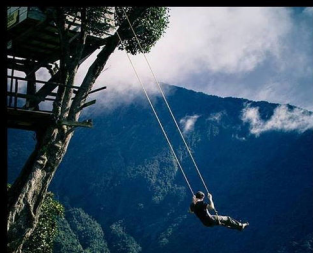
There's a swing on the edge of a cliff in Ecuador. It has no safety measures and is called the "Swing at the End of the World".