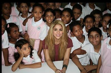
Shakira has been making music for more than 23 years and can play the guitar, drums, percussion and harmonica. She also speaks 7 different languages, is the founder of a charity called Pies Descalzos and is a goodwill ambassador for UNICEF.