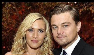
Leonardo DiCaprio and Kate Winslet helped pay the nursing home fees for the last Titanic survivor so she wouldn't have to sell anymore Titanic mementos to raise cash.