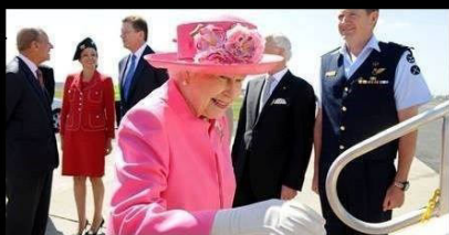
Queen Elizabeth does not hold a passport. Since all British passports are issued in the queen's name, she herself doesn't need one. She just has to say that she is the queen.