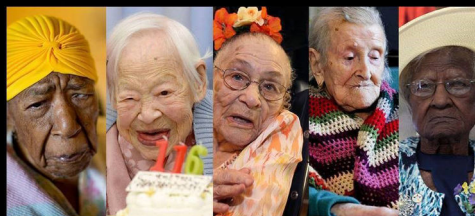
These 5 women are the "Last Living People" born in 1800's.