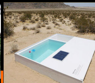
There is a secret swimming pool in the Mojave Desert that anyone can use. There are no roads, trails or signs that lead to the pool.