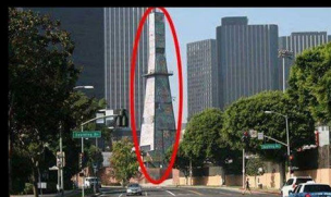
The city of Los Angeles is the 3rd most productive oil field in the U.S., but most of the oil wells are camouflaged inside of fake office buildings and even sculptures.