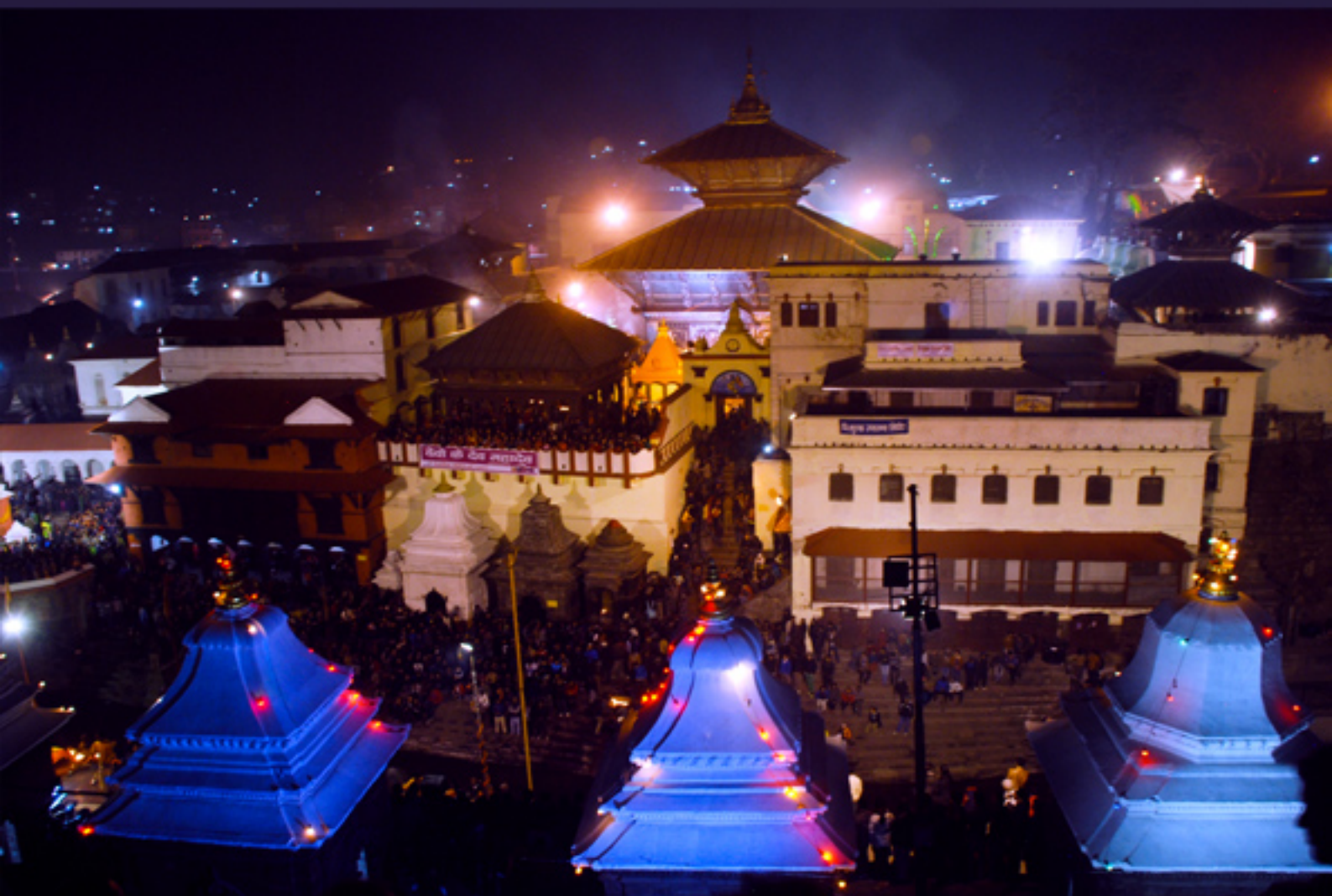
Night View of Pashupatinath Temple